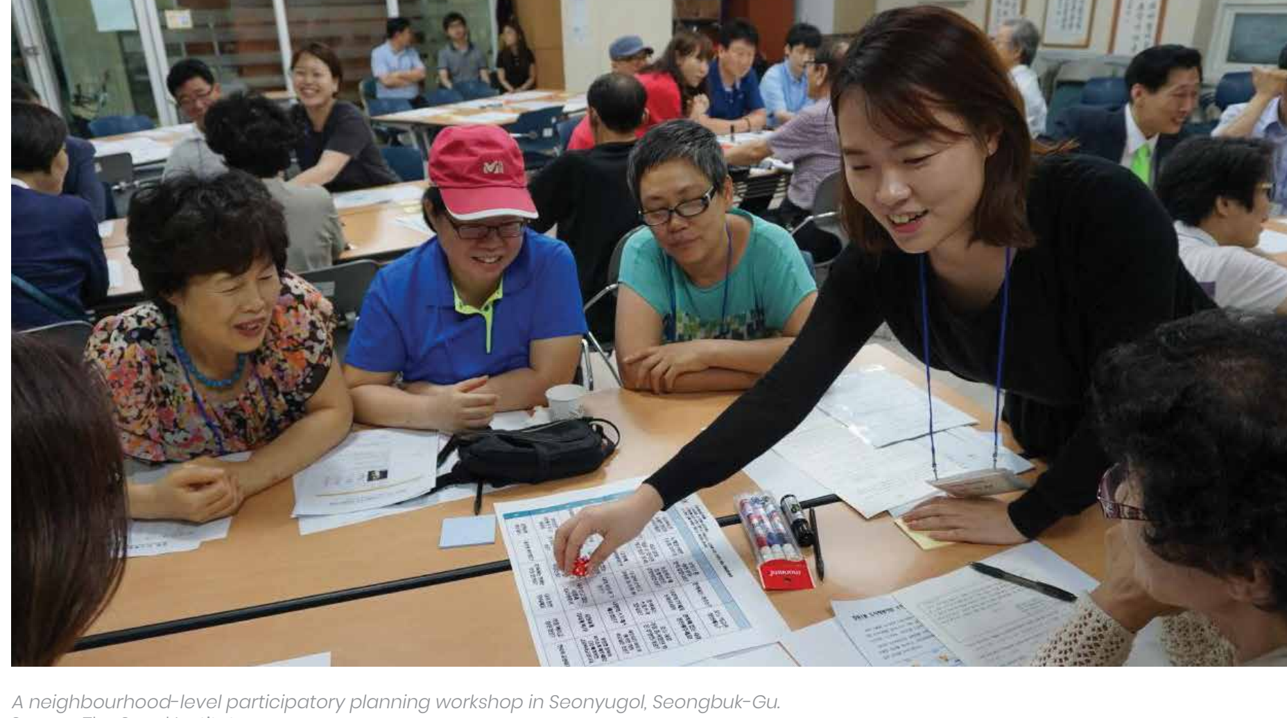
A neighbourhood-level participatory planning workshop in Seonyugol, Seongbuk-Gu.