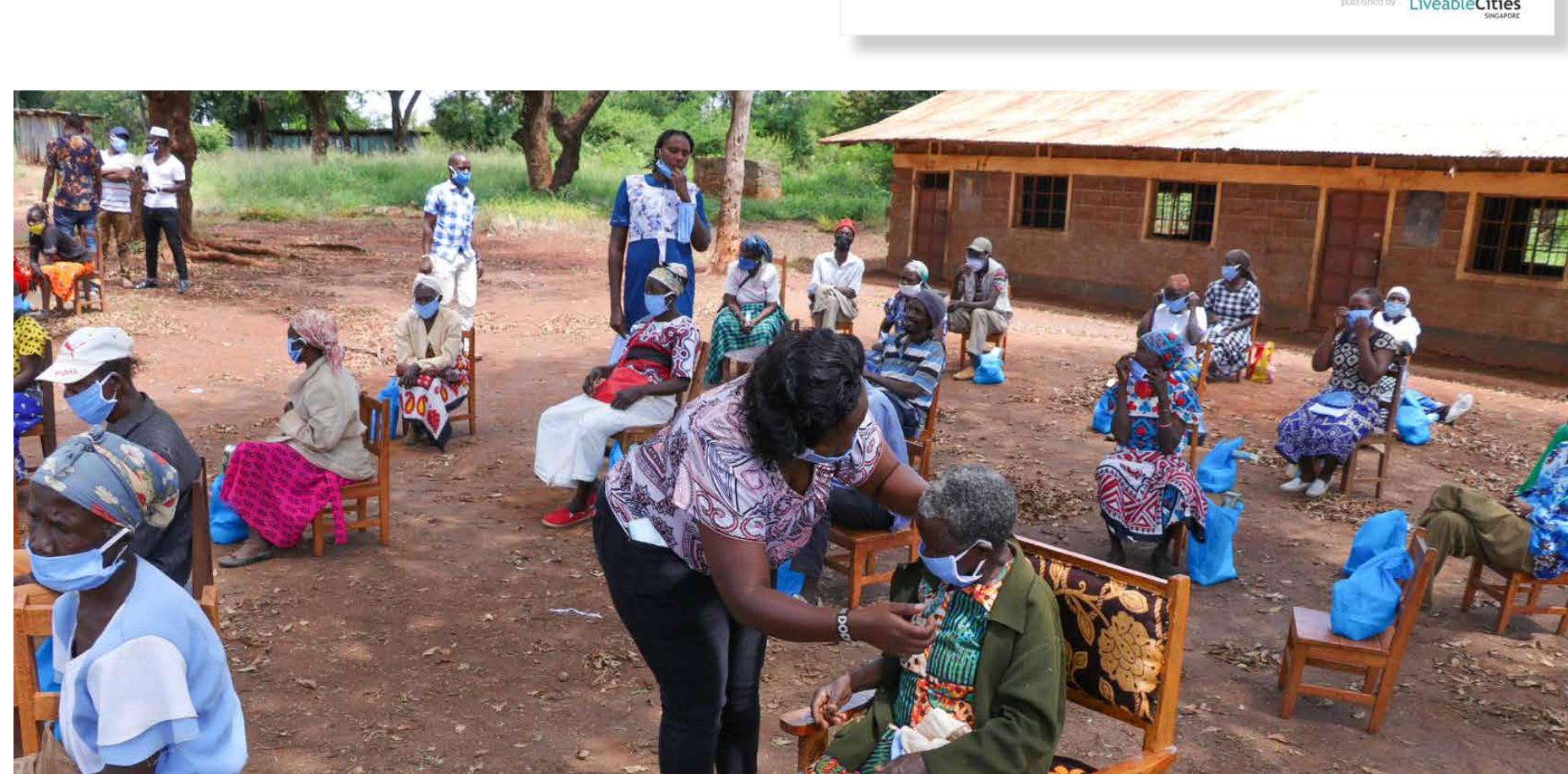
Volunteers ensure elderly residents in Kenyan villages are well taken care of during the pandemic.