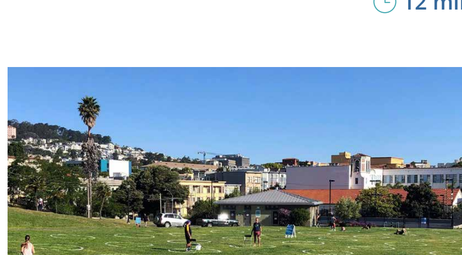
"Human parking spaces" in Mission Dolores Park in San Francisco.