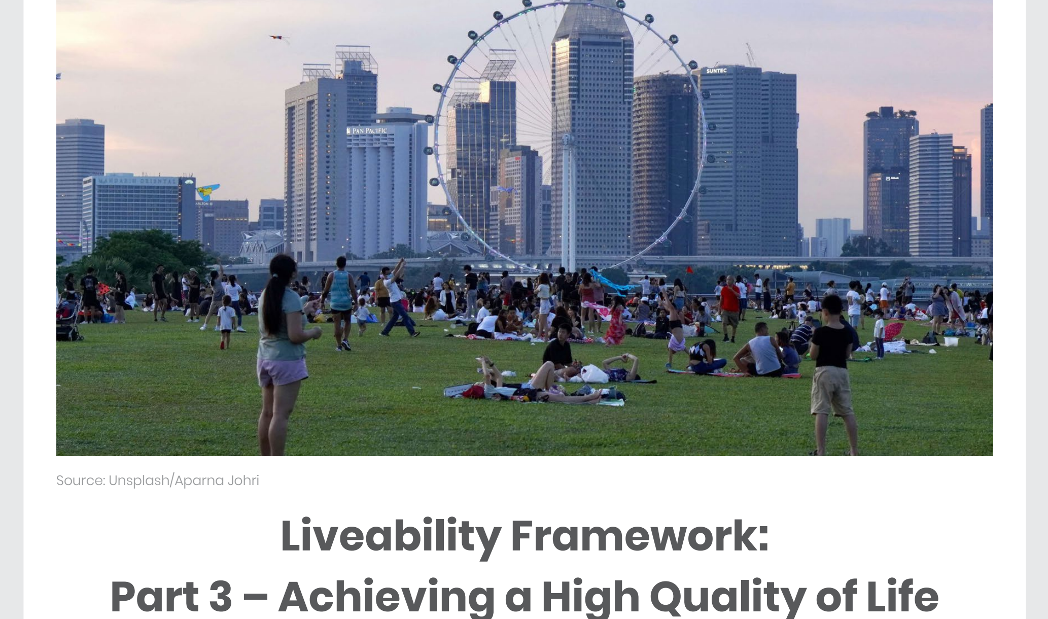
The refreshed Liveability Framework was launched at the World Cities Summit in June 2024. This is the third of a 10-part series to introduce the various components of the Framework.

CLC's research experience to foster stronger knowledge sharing and awareness of social science-related research, methodologies and tools; share how SBS contributes toward concrete and impactful outcomes for the urban environment; identify opportunities for collaboration and seeding of innovative cross-cutting research; and build capabilities and a sense of community in the SBS research community across government and academia. \bigcirc 5 min | Read \rightarrow