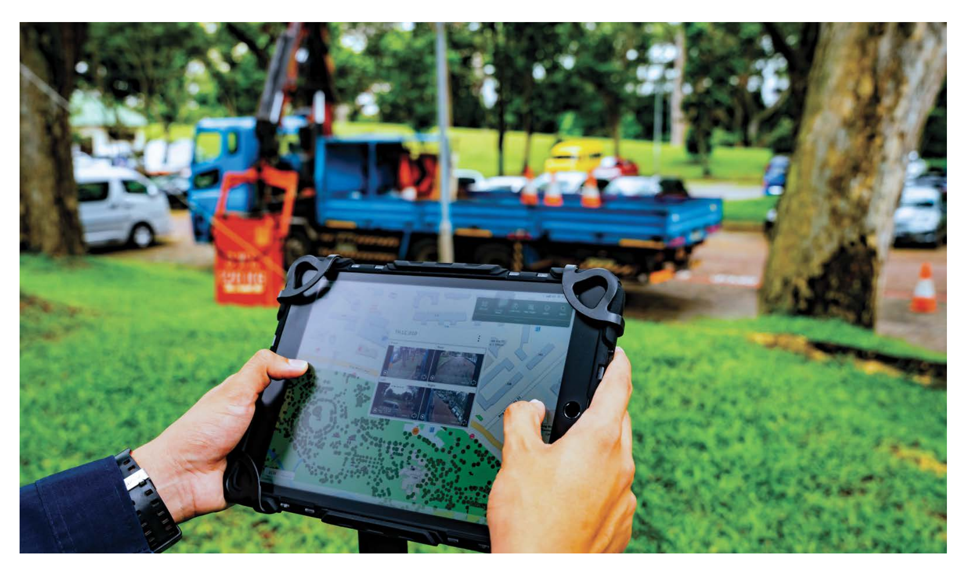
A blannual magazine published by LiveableCities