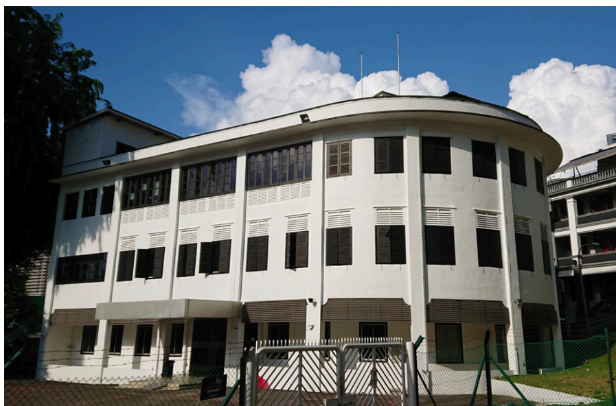
Figure 5: State properties such as this one at Kadayannallur Street in Tanjong Pagar are ideally located for co-living facilities. Spaces such as these can potentially be converted into co-living units.

Planning and land-use-related interventions to foster the growth of the co-living sector in Singapore could encourage the development of ecosystems of professionals such as architects and