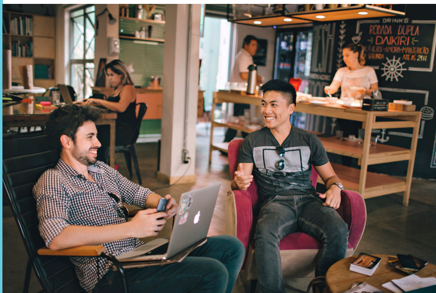
Figure 1: Many co-living developments feature communal facilities such as working spaces, kitchens and living areas that provide room for socialising.

Co-living is a popular housing option for young adults moving to major cities in pursuit of professional opportunities. In many cities, co-living is an affordable and attractive alternative to the conventional housing market, where rentals for well-located homes remain beyond the reach of those without a generous expatriate package. However, can such a business model be successfully replicated and grown in Singapore?