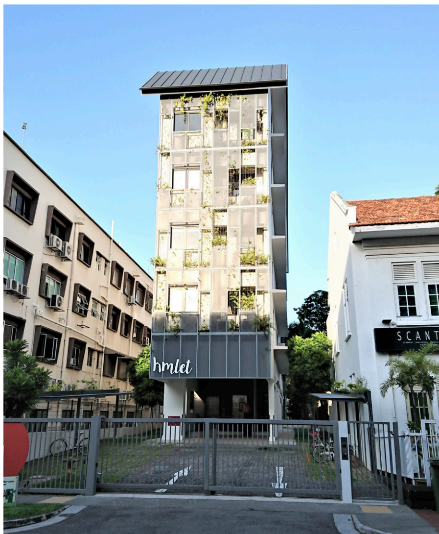
Figure 4: Singapore-based Hmlet operates a co-living facility in this Joo Chiat condominium complex.

Ascott, one of the few developers with the aforementioned financial capability, purchased a piece of land at Nepal Hill to develop a co-living complex. It has also established another co-living facility at Funan Centre, which is owned by its parent company CapitaLand. In this way, it has been able to avoid many of the challenges encountered by small start-ups. In addition, its upcoming Lyf projects are not subject to the URA's three-month minimum stay rule for residential premises, since they have been approved for serviced apartment or "short-term stay" use. 7 Units in these projects can potentially be leased on a nightly or weekly basis to transient visitors