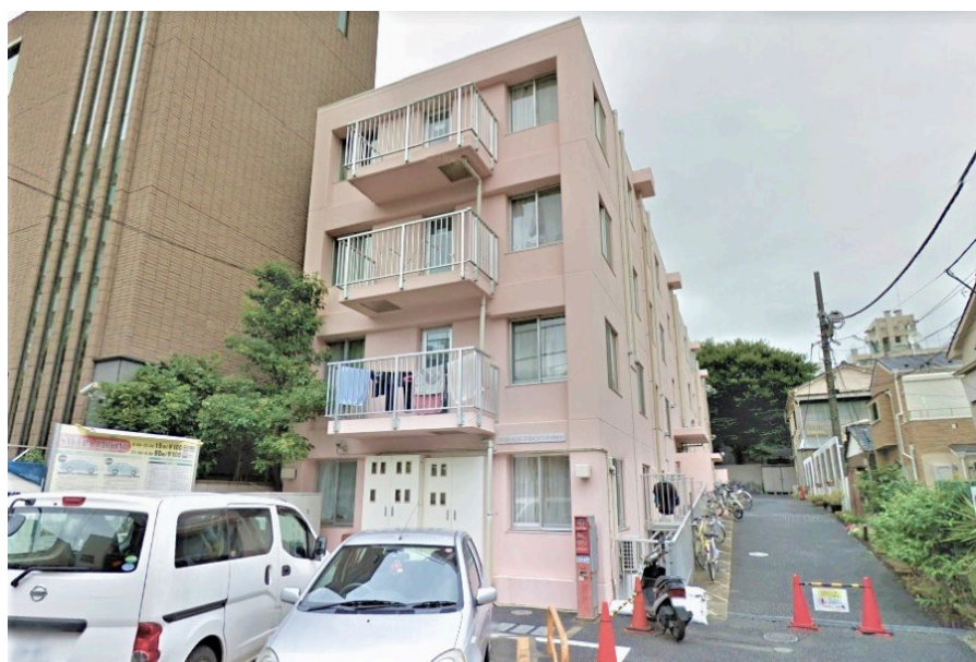
Figure 3: Japan's Sakura House operates a network of co-living projects in small apartment buildings across Tokyo, including this four-storey facility in Shibuya.

Operators are free to sublet individual bedrooms in an apartment as long as they obtain the agreement of their landlords and comply with the Urban Redevelopment Authority's (URA) requirements that (i) residents stay in the unit for no shorter than three consecutive months, and (ii) the total